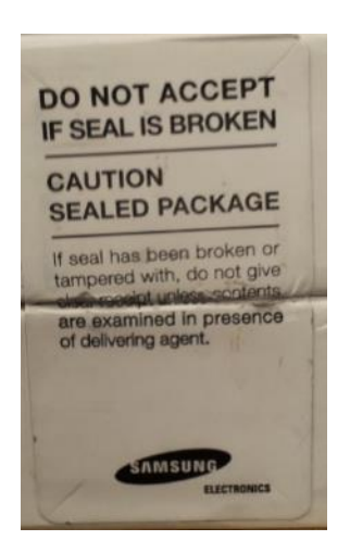
Figure 4 - Security Seal (White)