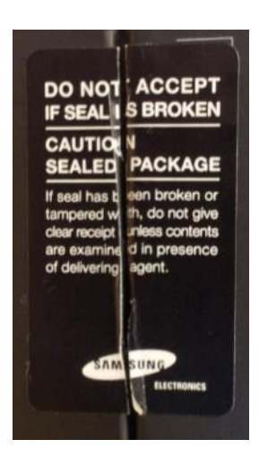
Figure 3 - Security Seal (Black)