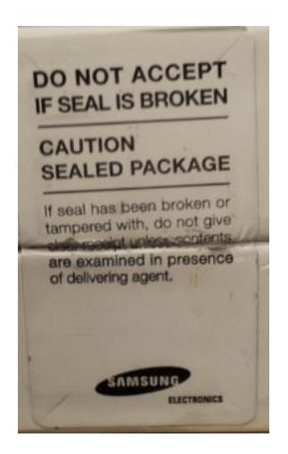
Figure 4 - Security Seal (White)