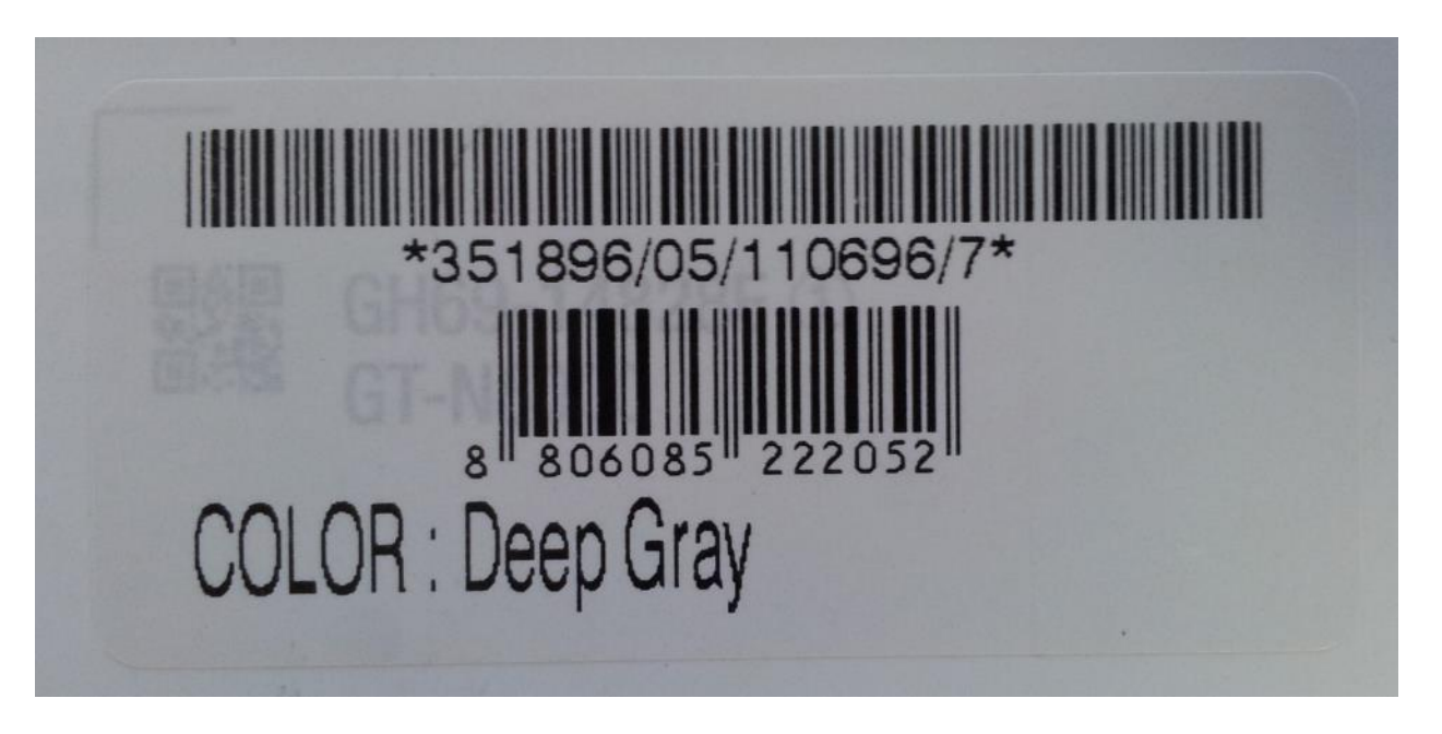
Figure 2 - Tracking Label

The tracking label should look similar to Figure 2 - Tracking Label, while the two tamper labels should appear similar to Figure 3 - Security Seal (Black) or Figure 4 - Security Seal (White).