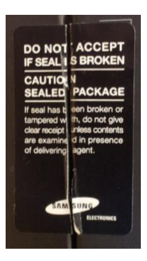
Figure 3 - Security Seal (Black)