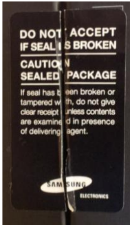
Figure 3 - Security Seal (Black)