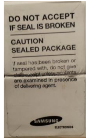
Figure 4 - Security Seal (White)