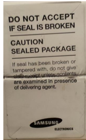
Figure 4 - Security Seal (White)