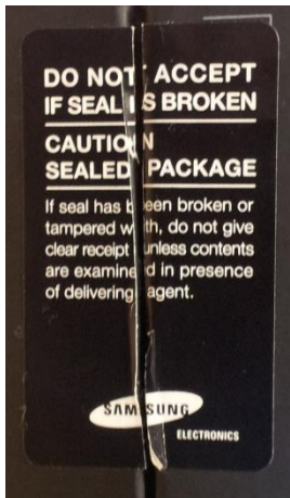
Figure 3 - Security Seal (Black)