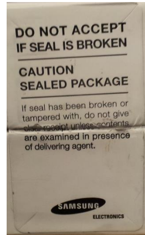
Figure 4 - Security Seal (White)