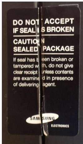
Figure 3 - Security Seal (Black)