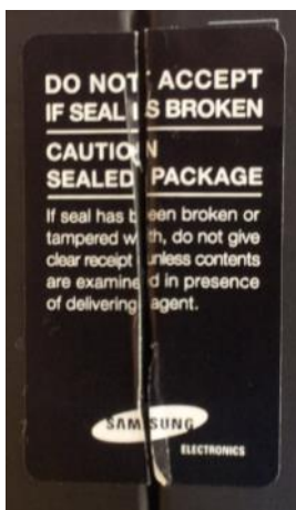
Figure 2 - Security Seal (Black)