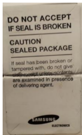
Figure 3 - Security Seal (White)