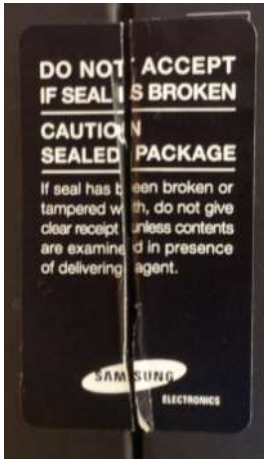
Figure 2 - Security Seal (Black)