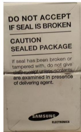
Figure 4 - Security Seal (White)