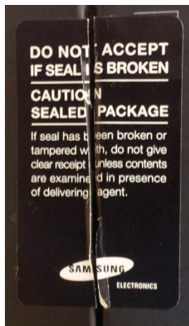
Figure 3 - Security Seal (Black)