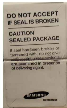
Figure 4 - Security Seal (White)